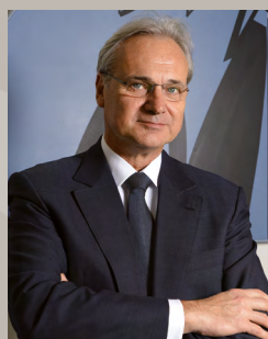
Dominique Louis, Assystem's Chairman

In conclusion, Assystem is certain that nuclear power needs to play a major role in energy transition and in the efforts to reduce global warming. The Group is ready to provide the French State with all of its skills and resources to enable the development of a new fleet of reactors so that by 2050, the country's electricity generation will be totally carbon free.